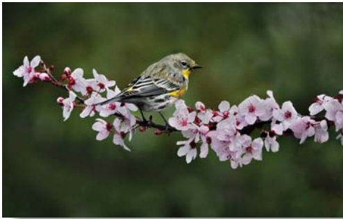
15 - Yellow-rumped warbler on Purple Plum Blossoms.jpg