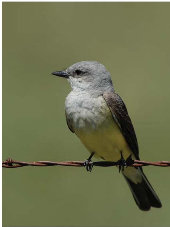
Western Kingbird Jeff Hobbs