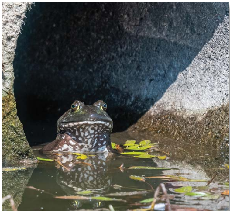
Toad in a Culvert